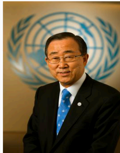
Ban Ki-Moon SG