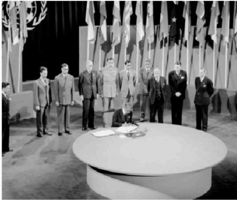
Conferencia de Sn Francisco